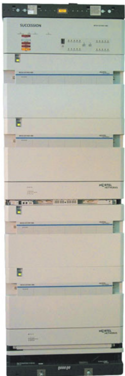
Nortel's Media Gateway 9000

With this hosting capability, the Media Gateway 9000 enables carriers to leverage their current TDM investments, dramatically reduce their capital expenses and simplify the task of migrating their wire centers to packet.