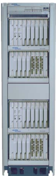
Media Gateway 15000

The Nortel Media Gateway 15000's advanced voice processing functionality — including multiple voice compression algorithms, voice quality enhancements, Quality of Service (QoS) silence suppression, T.38 Fax relay and RFC 2833 DTMF relay — enables band-